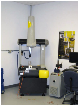
❖ Browne & Sharpe Global Image 555 20" x 20" x 6"