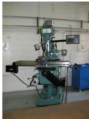
❖ Prototrax EMX